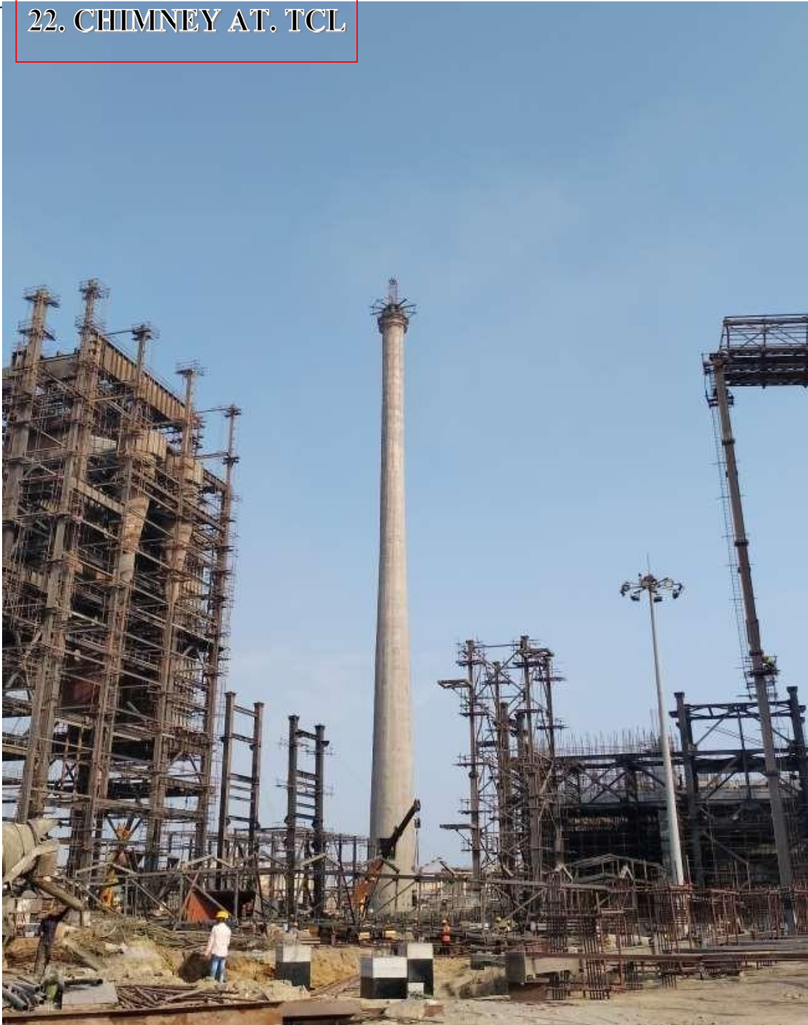
131 Mtr Ht. RCC Chimney At: Mithapur , Okha Clien:- Tata chemical ltd.