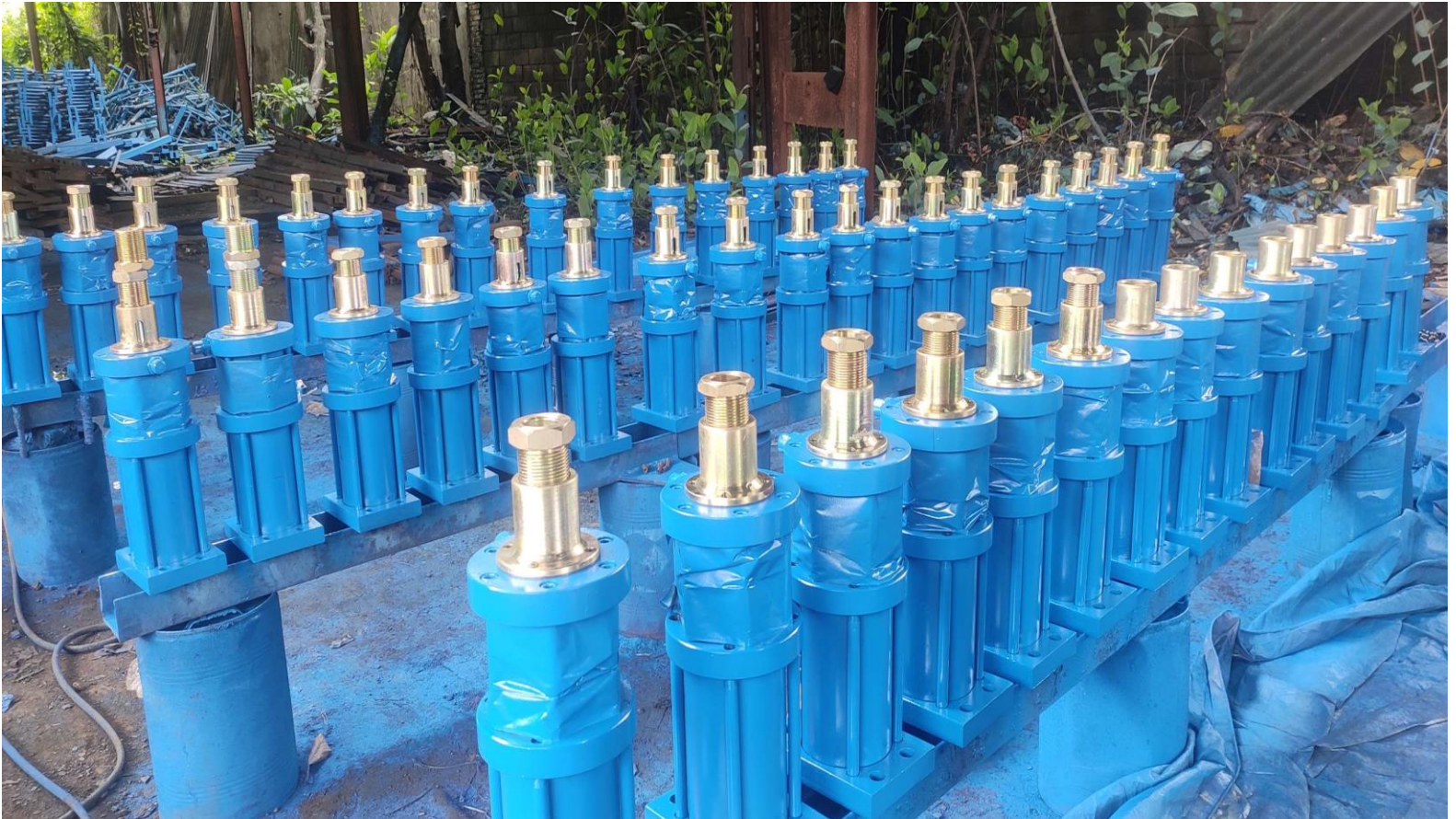
6 Ton Cap Hydraulic Ball Jack

www.saikrishnagroup.co.in , Email: arkhitdakua@ymail.com , saikrishna_engg@ymail.com