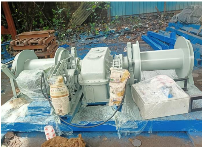
5 Ton Cap Double Drum Winch Machine