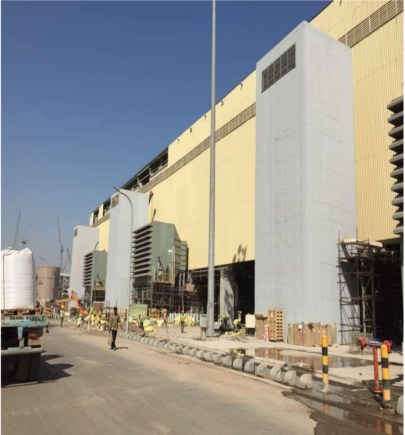
24 Nos of Evaporation Cooler