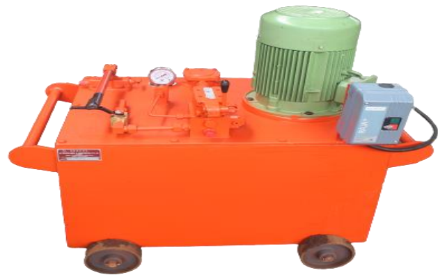
10HP Hydraulic power pack