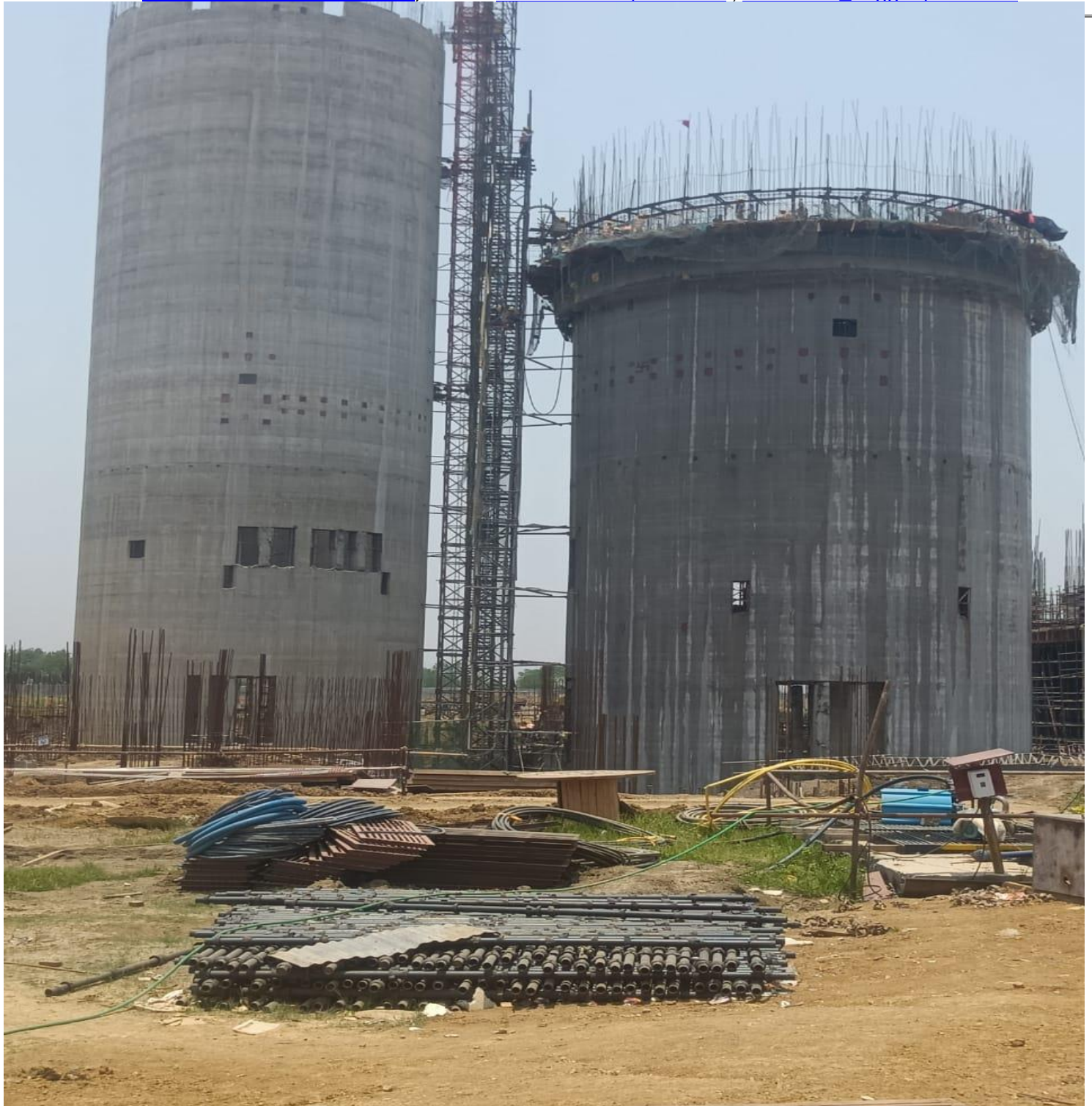
18.8 Mtr Dia, 52 Mtr Ht. 1 No of Cement silo At. Baloda Bazar, Chattisgarh. Client: - Ultra Tech Cement

www.saikrishnagroup.co.in , Email: arkhitdakua@ymail.com , saikrishna_engg@ymail.com