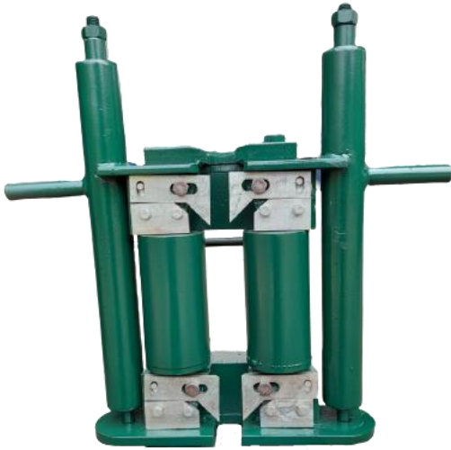
12 Ton Cap Single Acting Tank Lifting Jack