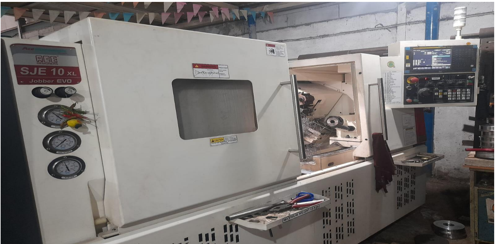
2 Nos of ACE 700 CNC Machine

Regd. Office :- A-1203 , Riviera 'A' Wing , Siddheshwar Garden, Kolshet Road, Thane-400607.