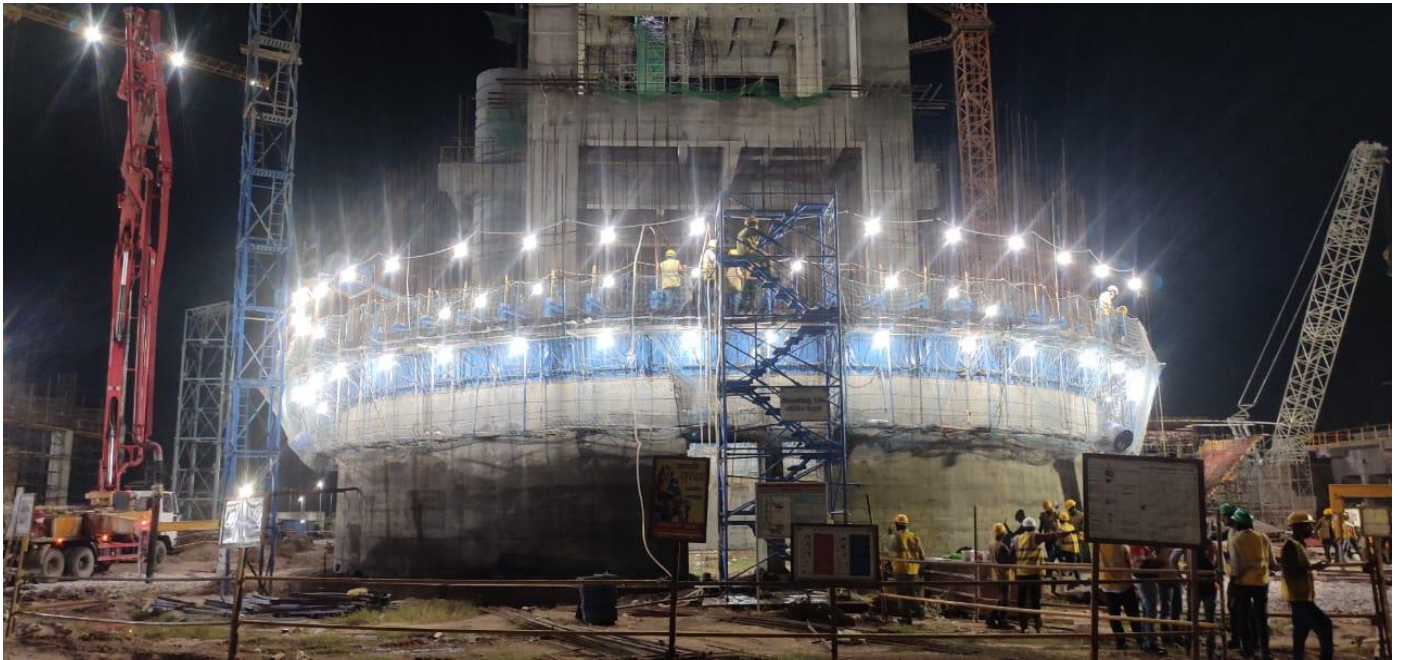
Bending Silo Erection at Ambuja cement Ltd. Nagaur (RJ)

www.saikrishnagroup.co.in , Email: arkhitdakua@gmail.com , saikrishna_engg@gmail.com